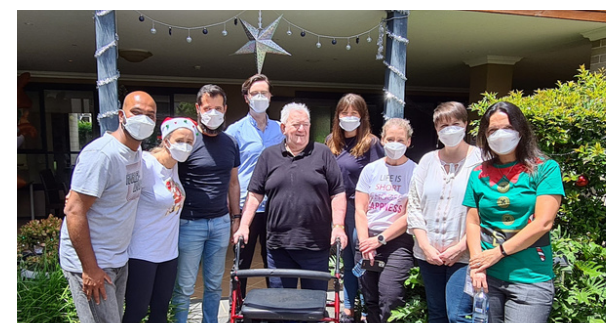
Mercer Corporate Volunteers decorate Mt Terry