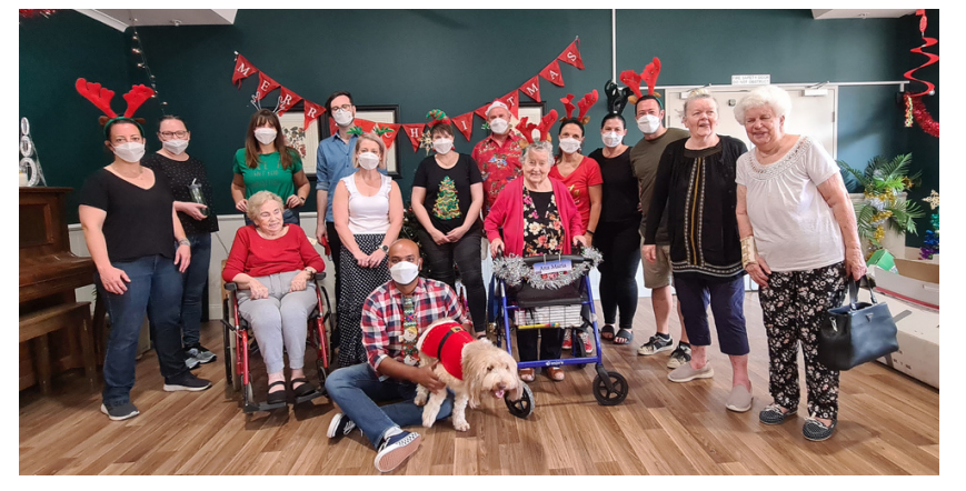
Mercer Corporate Volunteers decorate Warilla