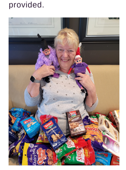
Illawarra Auxiliary donations