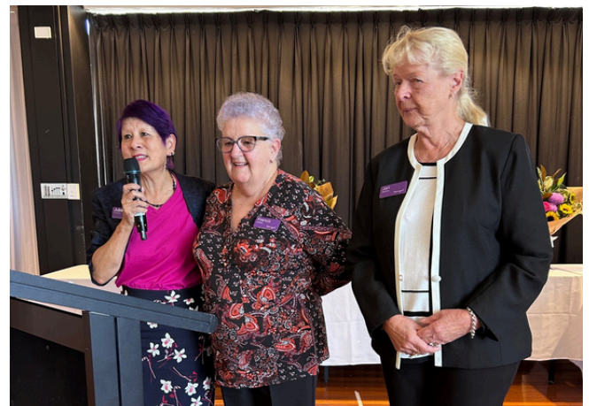
Warrigal Care Auxiliary & Op Shop

Congratulations all the volunteers from the Warrigal Care Auxiliary & Op Shop: