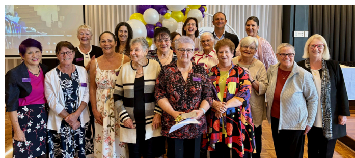
Warrigal Care Auxiliary & Op Shop