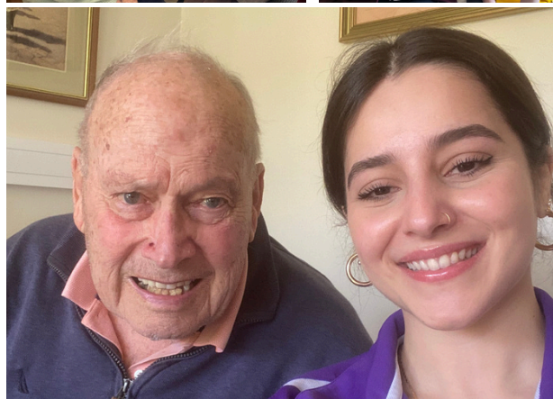
Know Me Program Volunteers - Wave 3

The volunteers then create a beautiful four minute life story video that assists staff and allied health teams get to know the resident on a deeper level.