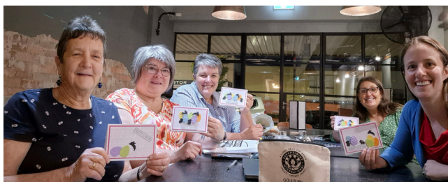
Soroptimist International of Goulburn

There has even been a special request for Tori to do a ballet performance, something everyone is already looking forward to!