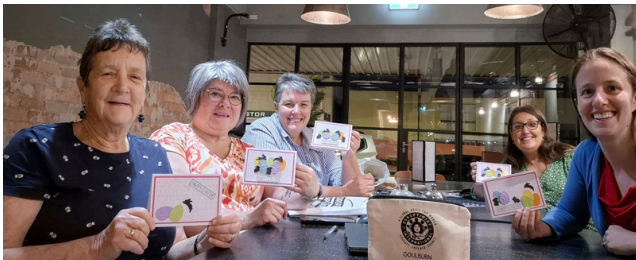
Soroptimist International of Goulburn

There has even been a special request for Tori to do a ballet performance, something everyone is already looking forward to!